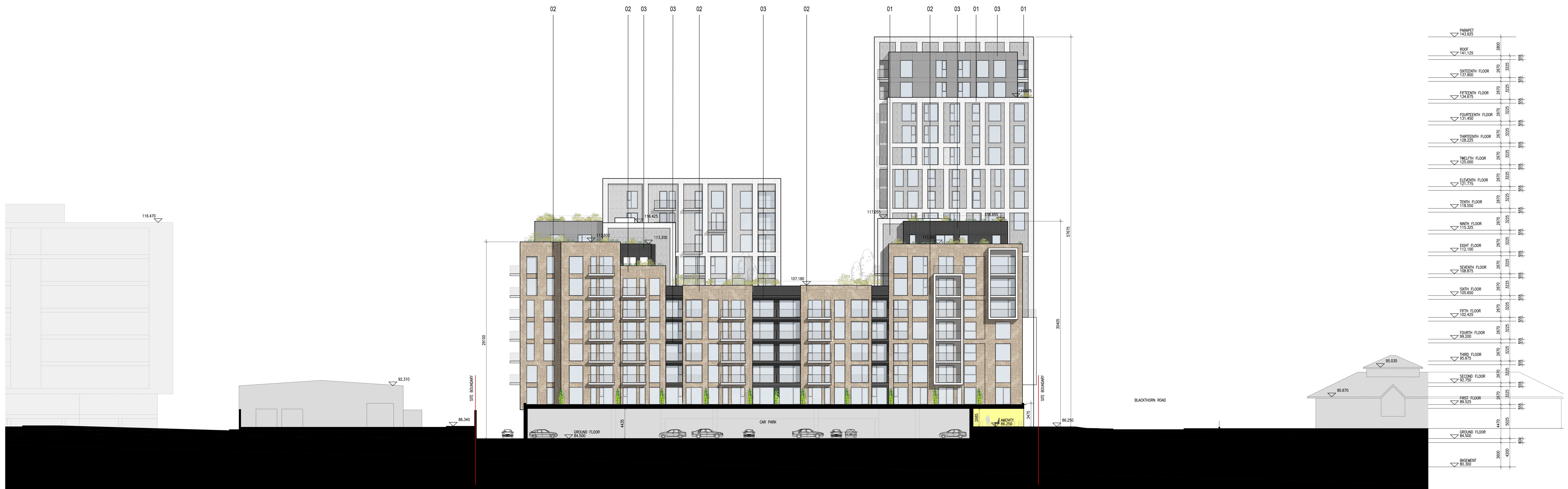
1 Contextual South-West Elevation 203 1:200